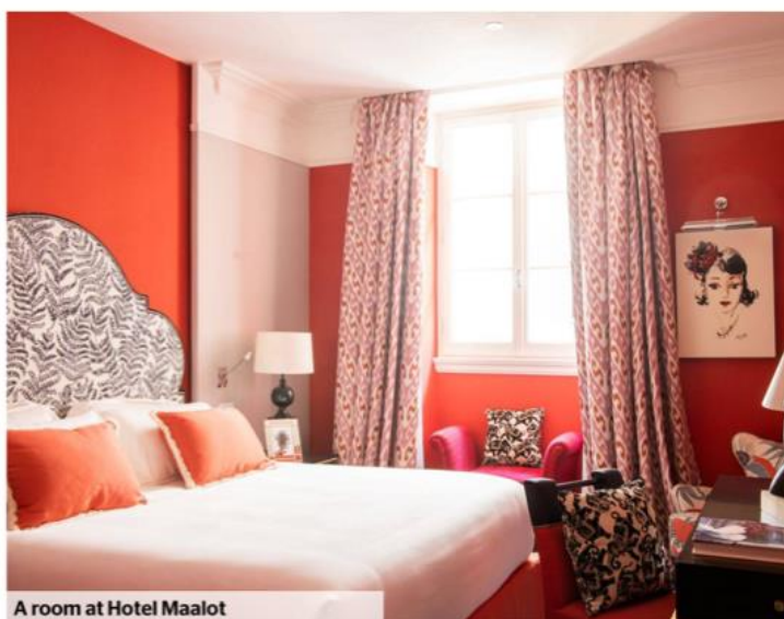
A room at Hotel Maalot

You can admire this palette from the hotel's restaurant, now